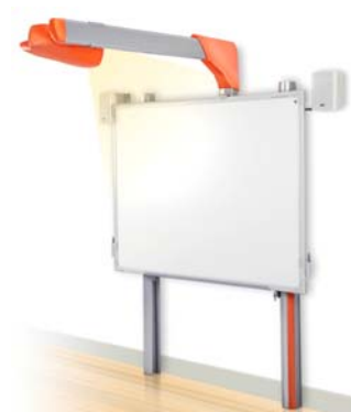
Figure 1: A typical permanent installation of a Promethean Interactive Whiteboard

This year a phased trial of interactive whiteboards will be running in SUPA rooms around Scotland. The initial trial will consist of permanent boards installed in Glasgow and Edinburgh. In addition, a portable system will be used to allow other users to evaluate the interactive board for their sites. It is hoped that this exciting technology will allow increased interactivity in SUPA lectures and tutorials.